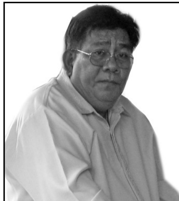
Vice Mayor Teo Atienza during his speech on why he refuses to sign Land Bank resolution passed by the Municipal Council.

The proposed projects are: renovation of the Municipal hall, establishment of a convention center and low-cost dormitory at the public market, air-conditioning of the gymnasium, purchase of heavy equipments and purchase of service vehicles for