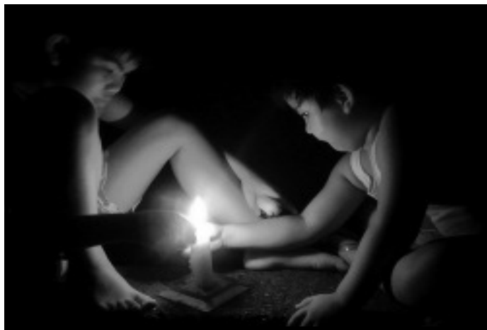
Brownouts happen when most needed

Resort owners complain of spending thousands of pesos to run their back-up generator. Worse is when appliances and other electrical equipments are damaged due to intermittent brownouts. ORMECO said they cannot be held liable for damages to appliances.